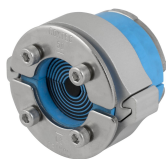
Sistema di sigillatura C RS SLO

Per informazioni dettagliate, visita la pagina roxtec.com .